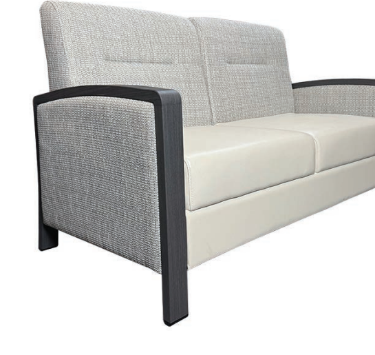
DANTE CHAIR | PADDED SIDEARMS