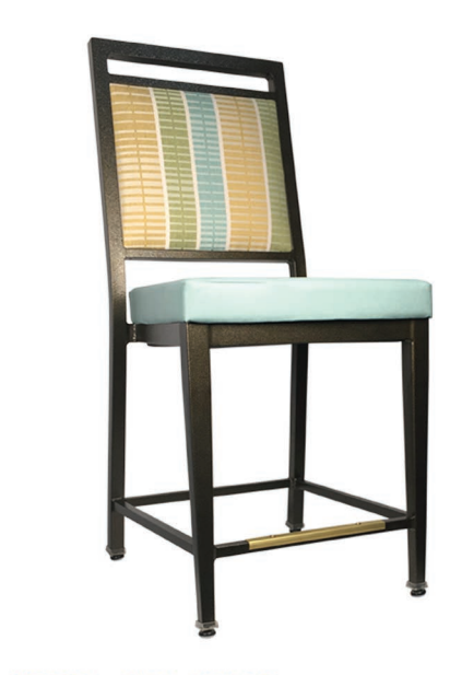
BAXTER - NO ARMS